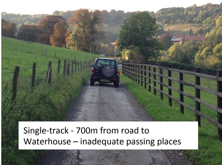
Single-track - 700m from road to Waterhouse – inadequate passing places