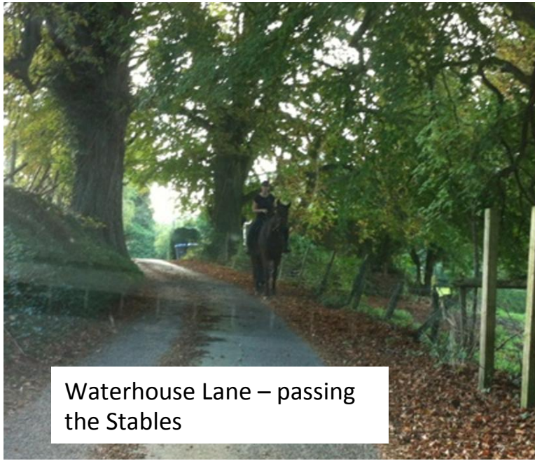
Waterhouse Lane – passing the Stables