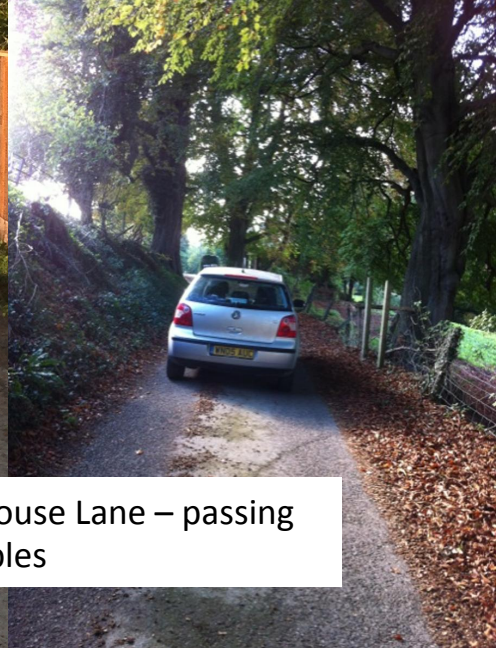
Waterhouse Lane – passing the Stables